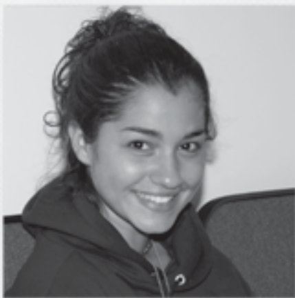
TEEN SOYO LEADER

St. Luke temporarily concludes his coverage of the life of John the Baptist by telling his readers that the child grew strong in the spirit, and spent his time in the deserts until his prophetic ministry began years later.